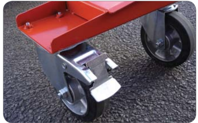
Two swivel castors, one of which is lockable, at the rear