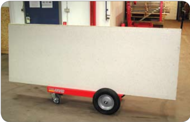
The load does not obstruct the view or create a large overhang

The two swivel castors – one of which is lockable – mean that two people can manoeuvre the trolley with ease. The board materials are supported during transportation due to the angle of the loading surface. The vertical support, which also acts as a handle, can easily be removed so that the trolley takes up less space when in transit between projects.