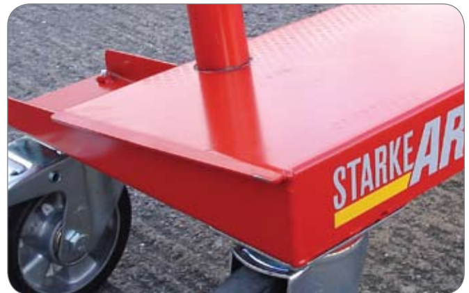
Angled edge on the short side reduces wear on the boards